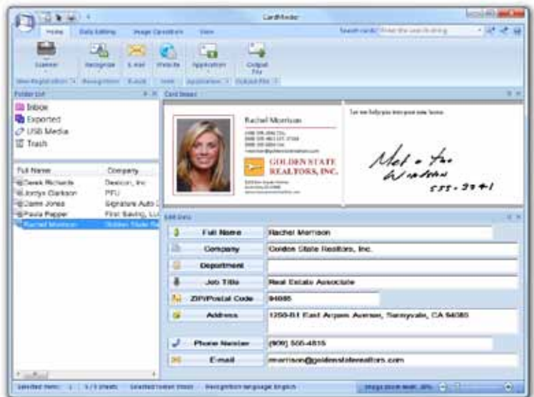
CardMinder for Windows® shown

Scan, store, and edit business card information with the bundled CardMinder software for Mac and PC and even export data into other applications like Address Book, Excel, and Salesforce.