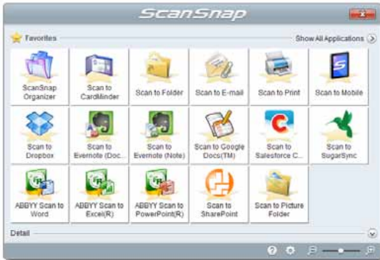
Quick Menu for Windows® shown

The ScanSnap Quick Menu for PC and Mac automatically pops up after scanning to provide you a variety of ways to be immediately productive with your scans. It can be easily customized to display just your favorites, present a recommendation, and even display custom profiles.